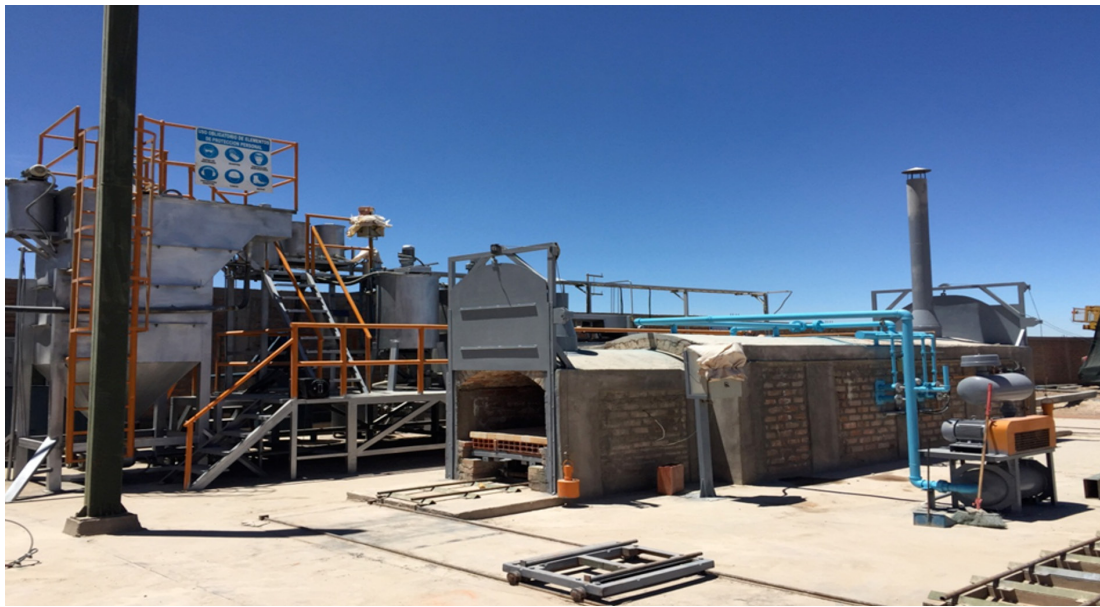
Figure 2. Prototype for bricks manufacture.

designed and built for this component: a feeder tank and a push system. The first one mix tailings coming from the field by using the Magnafloc flocculant and takes them to the Lamella Thickener. The pump system moves the solid part of the tailings mixture to the conditioning tank, which conditions the sedimented tailings, achieving a concentration of solid of around 30%. The product then moves in the neutralizing tank, where the cyanide is neutralized through the addition of Caro's acid, until it meets the environmental quality standards of 0.1 mg/L in the liquid part of the tailings mixture.