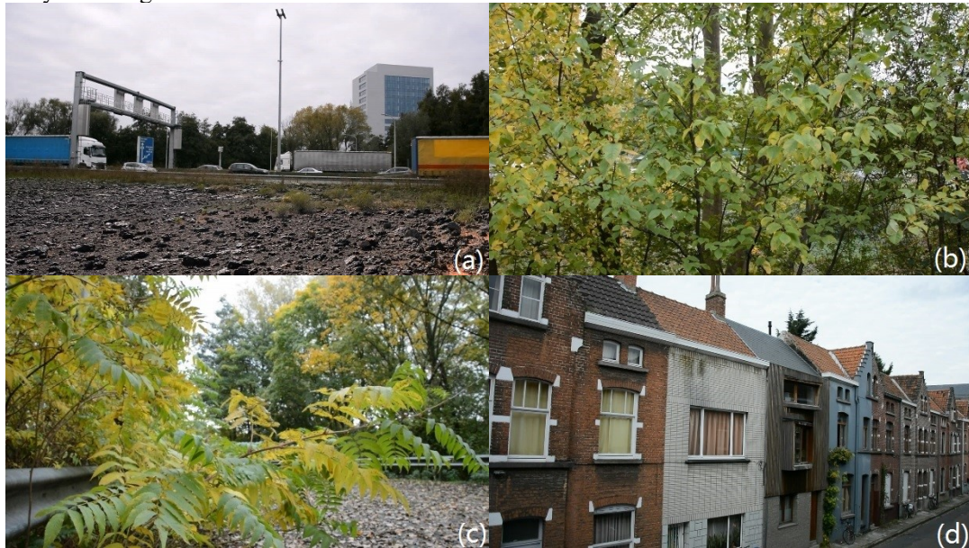
Figure 2 – Four window-sight sceneries

Four screenshots of the video's (all taken in Ghent, Belgium) are shown in Fig.2. Scene (a) is the total open view of highway traffic and contains very few green elements; (b) shows some parts of the highway traffic through the woods; (c) contains a totally green view and even some close shot of trees and branches, behind which it is assumed that there's busy traffic, although this can not be seen; and (d) shows a series of rather traditional Belgian dwellings, along a tranquil street but presumably hiding a highway from sight.