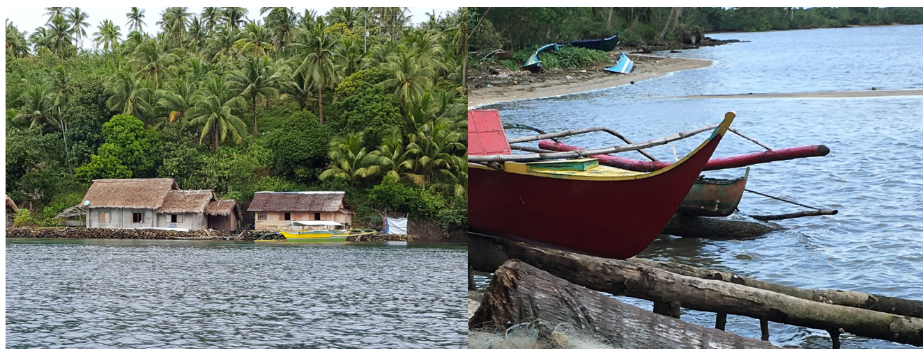
Fishing is one of the primary sources of livelihood for coastal and island communities.

Conversely, weak (or less inclusive) community engagement approaches focus on disseminating top-down information and gathering feedback on government proposals or issues through consultation via town hall meetings, surveys and committees. They tend to reflect normal business over time and lack willingness or knowledge to develop stronger approaches (Aldunce et al. 2016, Cavaye 2004, Hindmarsh 2012, Nkoana et al. 2017). Typically, they feature fragmented planning and policy processes that result in poor coordination and policy implementation. They perpetuate cultural barriers to participation involving cultural leadership, beliefs and perspectives; community marginalisation and lack of supportive resources (McMartin et al. 2018, Samaddar et al. 2015, Zafrin et al. 2014). The burgeoning international literature supports the view that strong community engagement is highly effective to address the interrelated social and environmental complexities of CCA and DRRM (e.g. Schlosberg et al. 2017, Tanwattana 2018).